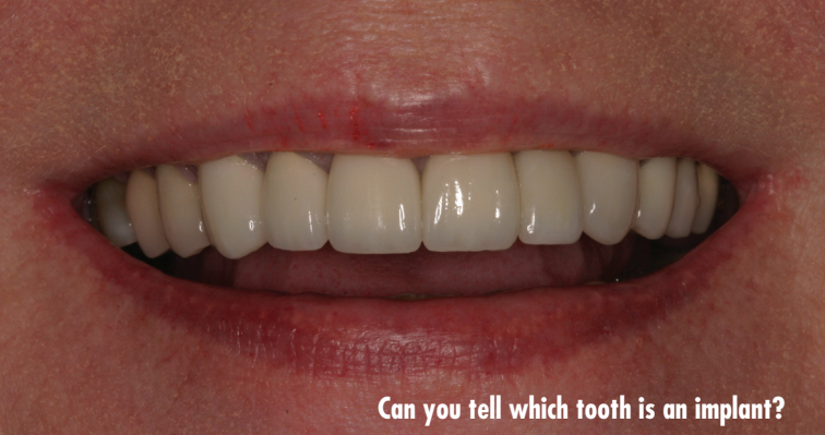
Can you tell which tooth is an implant?